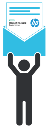
Support for your ongoing service agreements