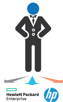
Service gateway to manufacturer