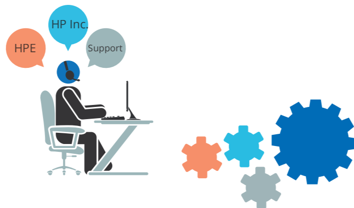
Use of the latest technology